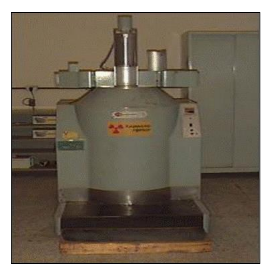
Figure 1: GAMMACELL model